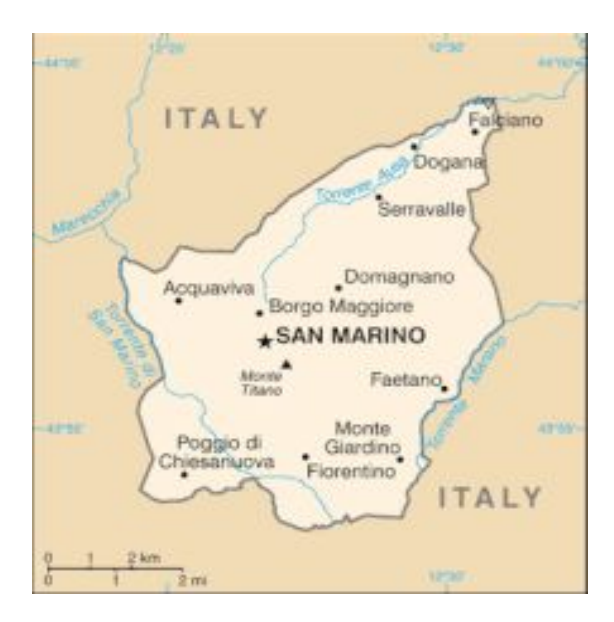
This is where San Marino is located.

San Marino is located on the Adriatic side of Italy. In San Marino their favorite sport to play is without a doubt soccer. This is because they have been taking part in international competitions since 1986! In San Marino, they like to eat Chinese, Indian and American cuisines, but they absolutely love to eat French and Italian cuisines.